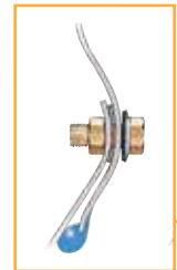
WITHOUT DRIP LIP

GSI's drip lip water deflection system is a one-of-a-kind, roll-formed bottom sheet edge which forces water away from the hopper and lower boot area. Complete weather protection without a loss in capacity.