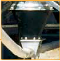
STRAIGHT DROP BOOT