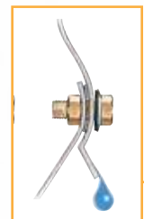
WITH DRIP LIP