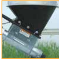
30° DROP BOOT