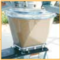
CLEAR STRAIGHT DROP BOOT